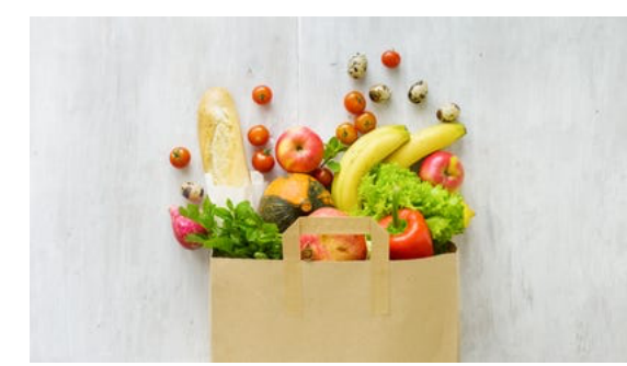
Food Bank of Delaware offering free monthly food boxes NEWS 4:52 p.m. ET Nov. 30